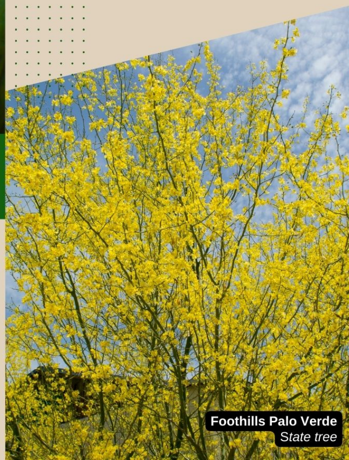
Foothills Palo Verde State tree

Sonoran Desert plants are identified along the half mile meandering trail that has been constructed on the desert slopes. The trail allows for interesting views of rock formations, desert flora, animal life and an abandoned P-Bar ranch campsite next to the April 25, 1941 constructed dam wall.