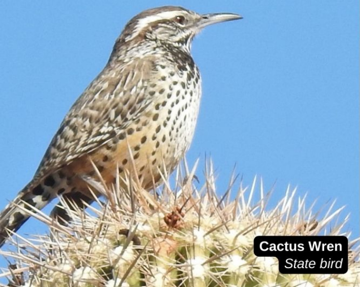
Cactus Wren State bird

The Garden is located on Fountain Hills Boulevard, between Emerald Drive and Kingtree Boulevard. The Emerald Wash is part of the Garden.