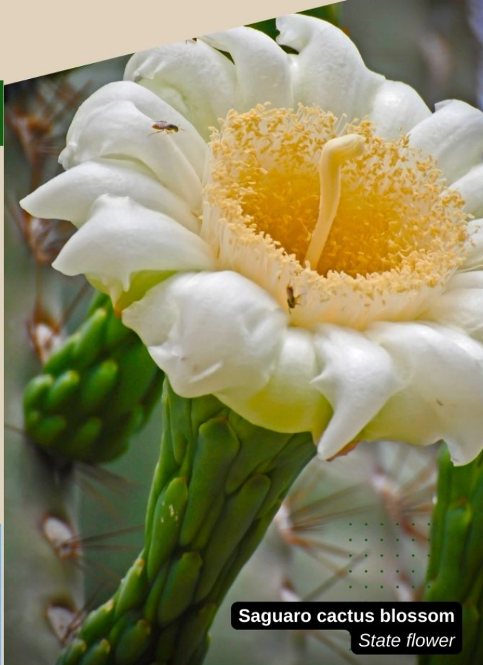
Saguaro cactus blossom State flower