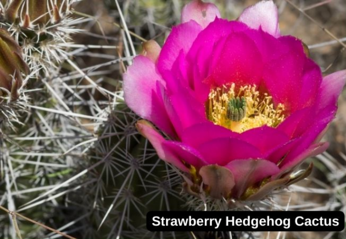
Strawberry Hedgehog Cactus