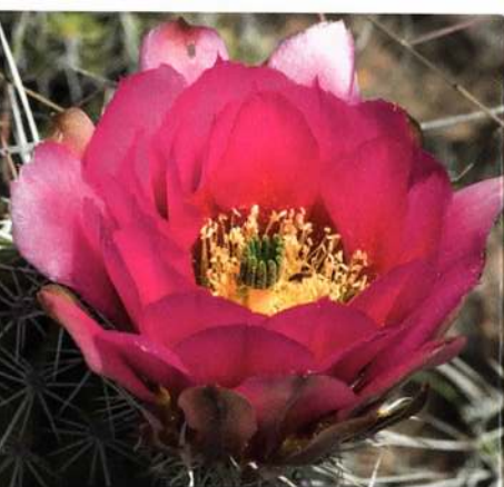
Strawberry Hedgehog Cactus