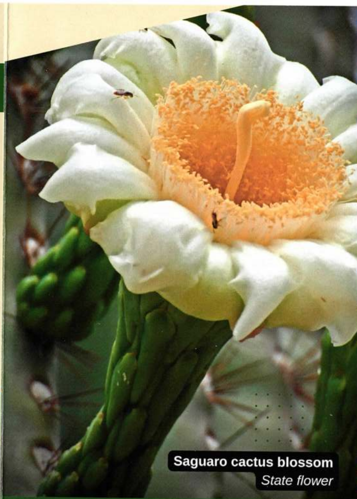
Saguaro cactus blossom State flower