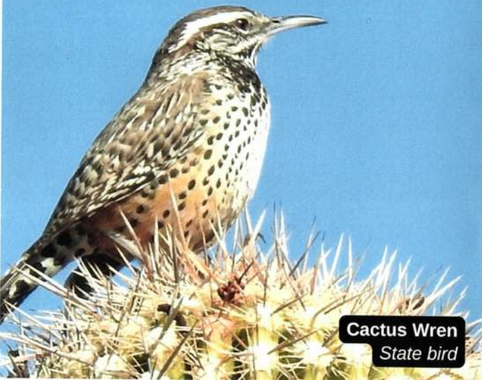
Cactus Wren State bird

The Garden is located on Fountain Hills Boulevard, between Emerald Drive and Kingstree Boulevard. The Emerald Wash is part of the Garden.